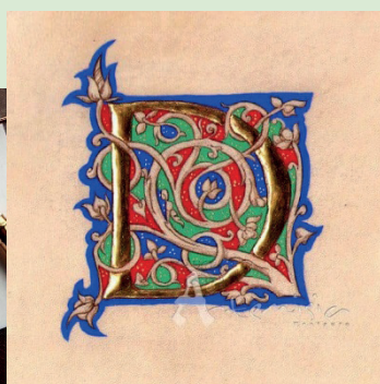
Gold lettering illumination